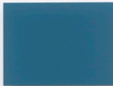
TWF 14521 Medium Blue