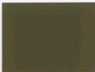
TWF 14721 Medium Bronze