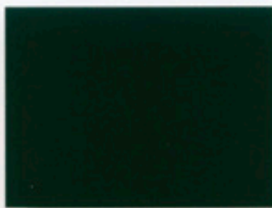
TWF 14422 Dark Green