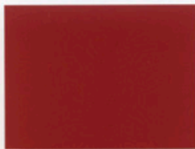
TWF 14321 Rust Red