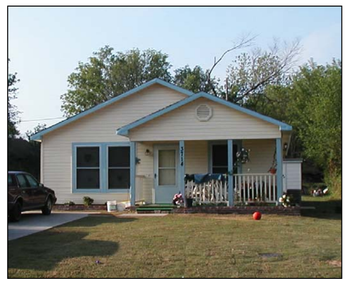
Habitat Homes – Before & After

Left: 3710 W. 52<sup>nd</sup> Place, under construction. Right: The house next door, completed by Habitat last year. Both have Thermal 700 Series double hungs in Clear Anodized finish.