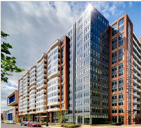
Camden Noma Washington, DC Bone White & Dark Gray Powder Coat