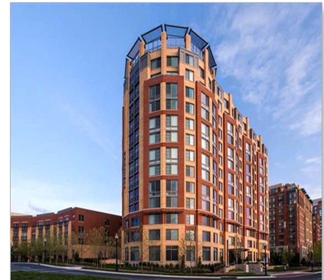
Carlyle Block (L) Alexandria, VA Dark Gray Powder Coat