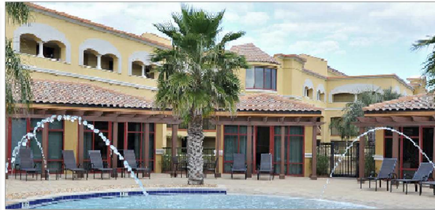
Sanctuary By the Sea Grayton Beach, FL Kynar Redwood