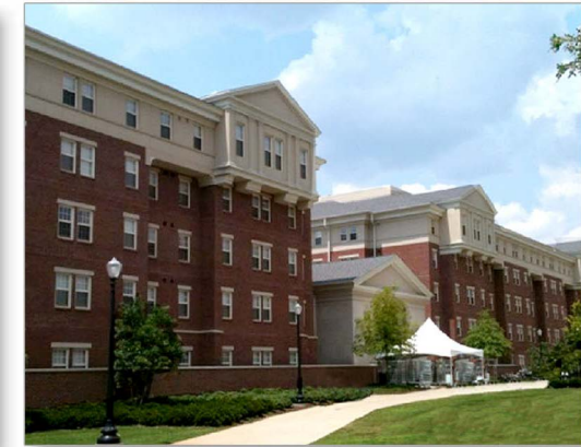
Ridgecrest South - Residence Hall Tuscaloosa, AL Antique White Powder Coat