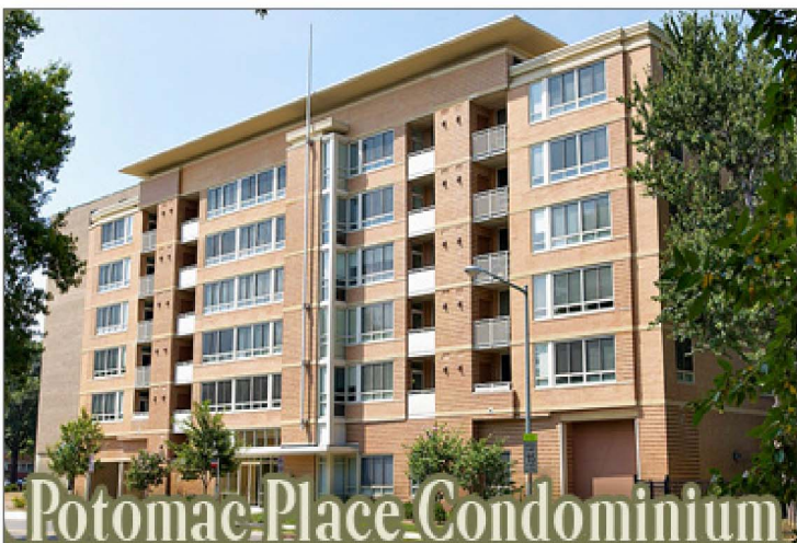
Potomac Place Condominium Oxon Hill, MD Collingwood Custom Powder Coat Finish