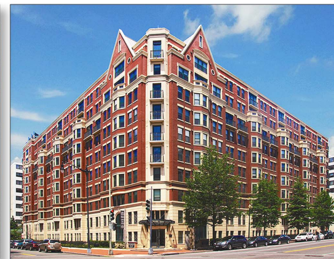
1301 Jefferson at Thomas Circle Washington, DC Dark Green Powder Coat