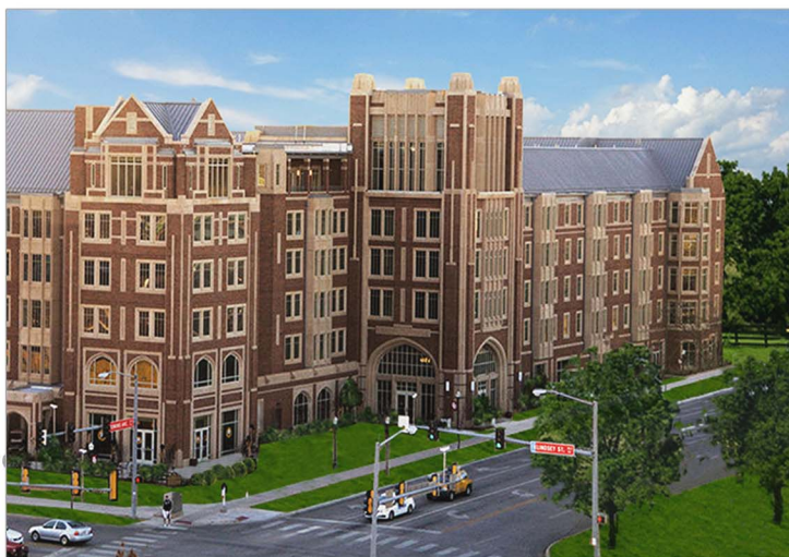
Headington Hall Norman, OK Almond Powder Coat