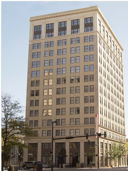
Ambassador Hotel Wichita, KS Bronze Powder Coat