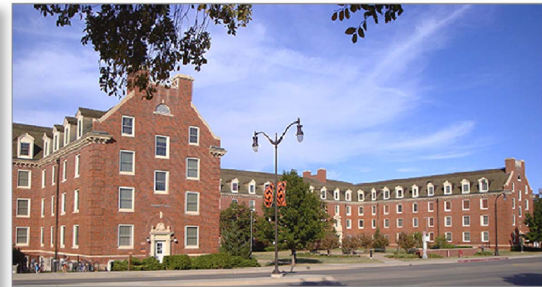
Bennett Hall Stillwater, OK Creme Powder Coat