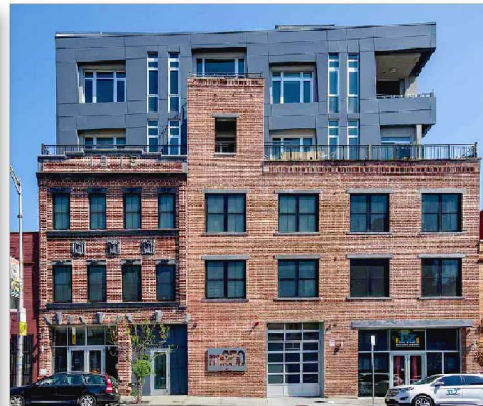
Jersey Digs - Montgomery St. Jersey City, NJ Black Powder Coat