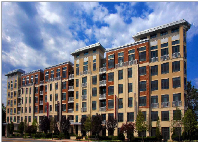
Solaire Wheaton Apartments Silver Springs, MD Bronze Powder Coat