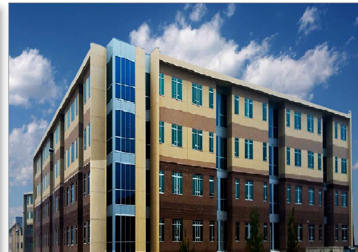
University of Texas Dallas, TX Clear Anodized II