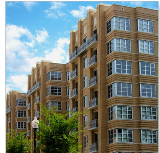
Highland Park Washington, DC Clear Anodized Class II