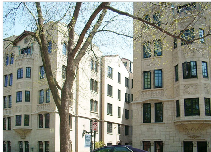
Bon Villa Oak Park, IL Black Powder Coat