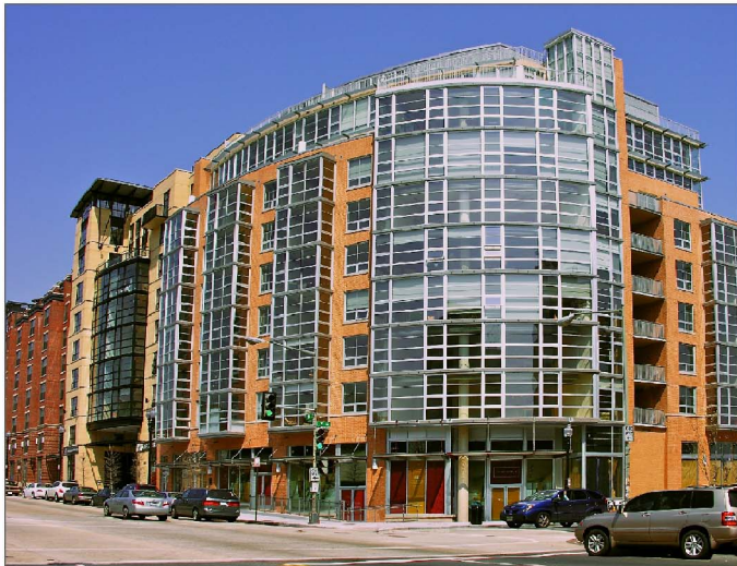
Flats at Union Row Washington, DC Satin Gray Powder Coat and Clear Anodized