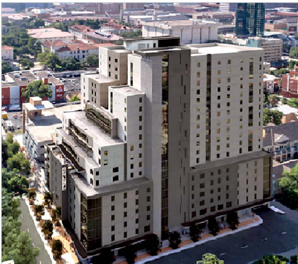
Skyloft Austin, TX Clear Anodized Class II