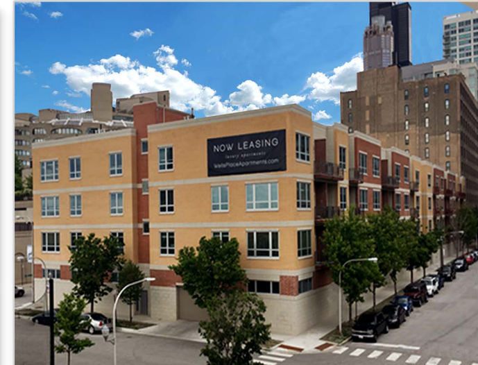
Wells Place 837 - 839 Wells Chicago, IL Clear Anodized Class II