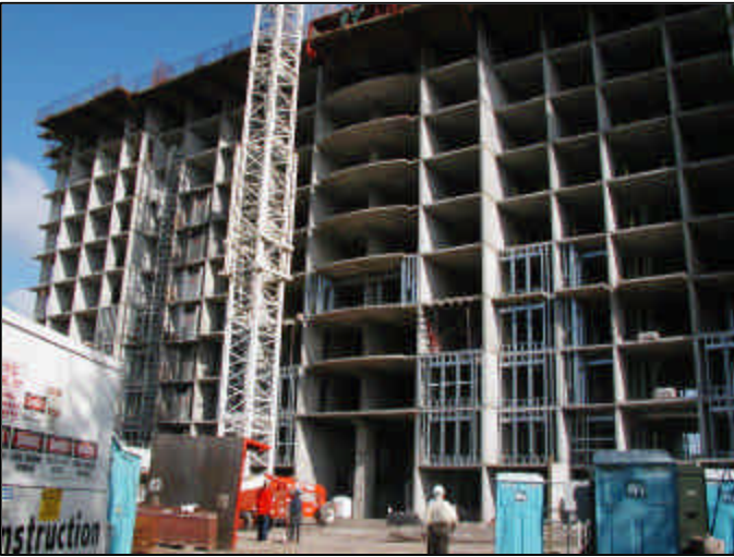
1200 Post Oak Road Luxury Apartments, Houston, TX Owner: The Hanover Corporation, Houston, TX Architect: Duree & Associates, Dallas, TX Contractor: The Hanover Corporation, Houston, TX Installer: Ken-Tex Products Co., Oak Point, TX Series 526 Horizontal Rolling & 550 Fixed Windows; Series 9910 Sliding Glass Doors Color: Bronze