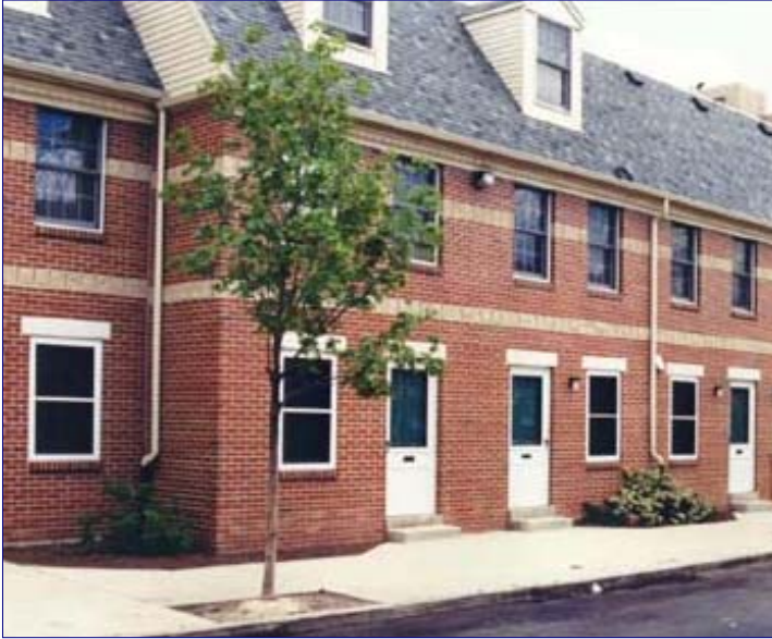
Military Housing and HUD Projects