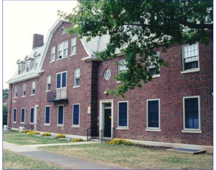
Schools and Dorms